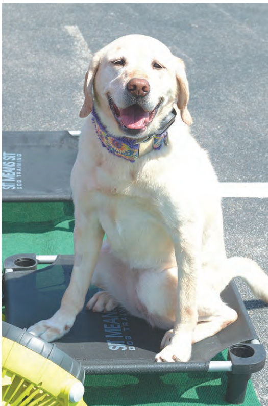
Golden lab, Q, cooling off