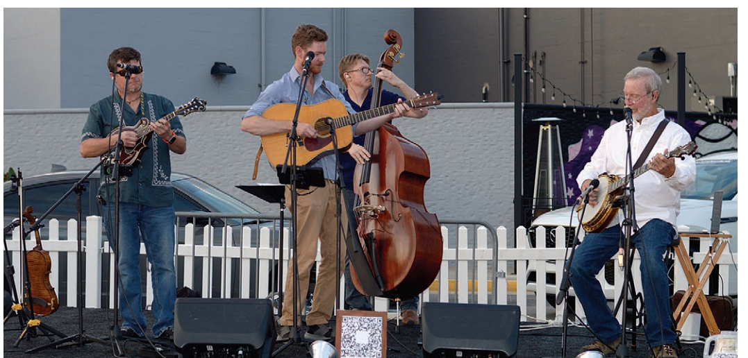
True Blue band