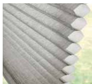
Cellular Honeycomb Shades

As much as 20% of your energy loss in your home is through your windows. Finding the right window treatment could go a long way towards saving you money and keeping your Holidays warm and full of cheer.