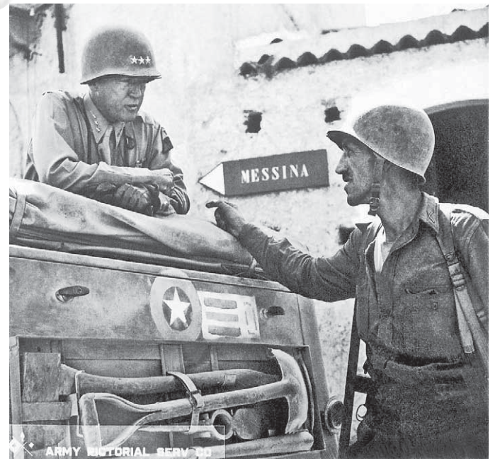
Patton near Brolo, Sicily, in 1943.