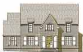
Lot 222 - The Aspen Houck Construction