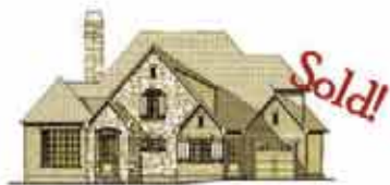
Lot 195 - The Montrose WoodPointe, LLC