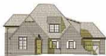
Lot 198 - The Pepperidge Houck Construction