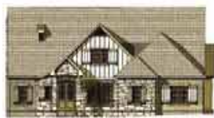
Lot 199 - The Avondale WoodPointe, LLC