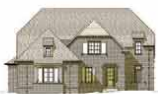
Lot 223 - The Willow Mead Houck Construction