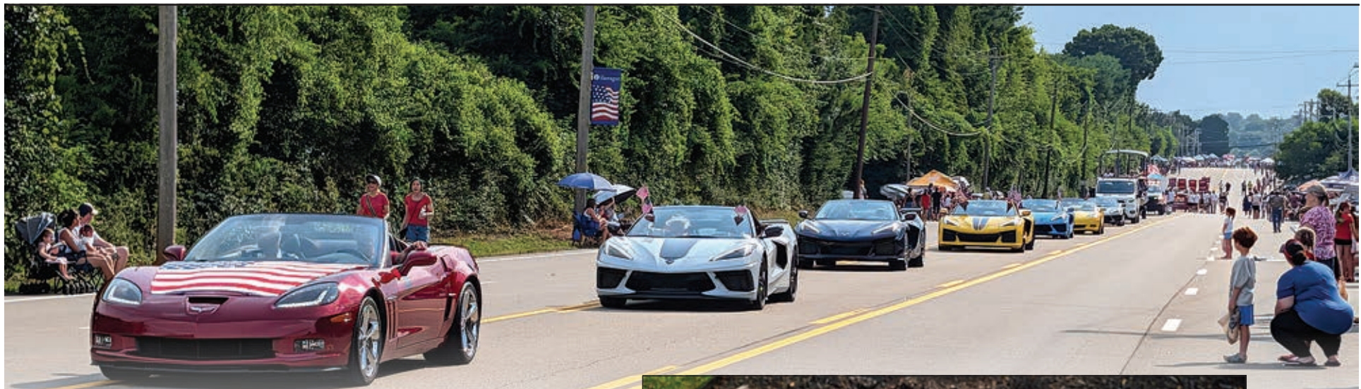
Grand marshals riding in Corvettes